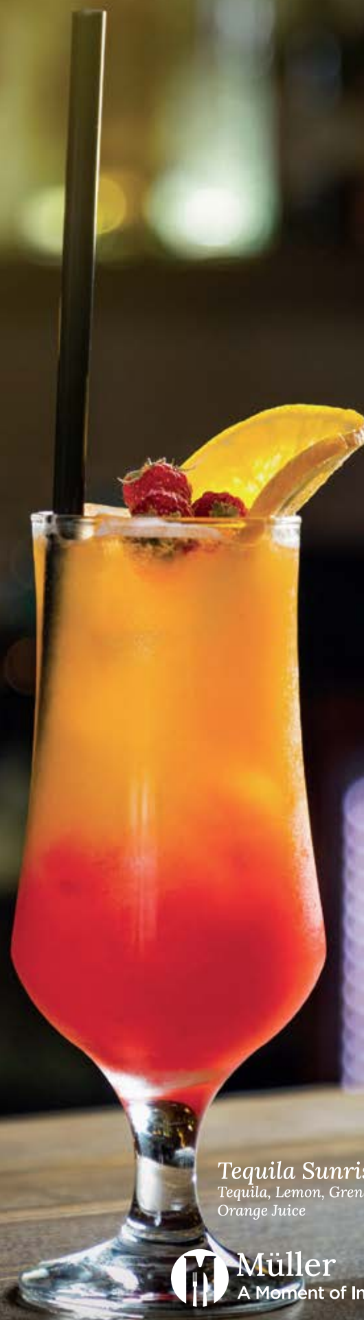
Tequila Sunrise Tequila, Lemon, Grenadine & Orange Juice